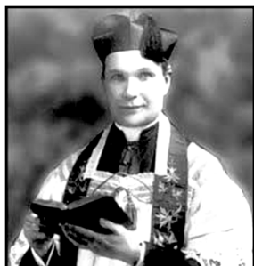
Let's Remember a Priest